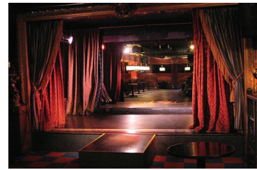
Entertainment & Sports Facilities